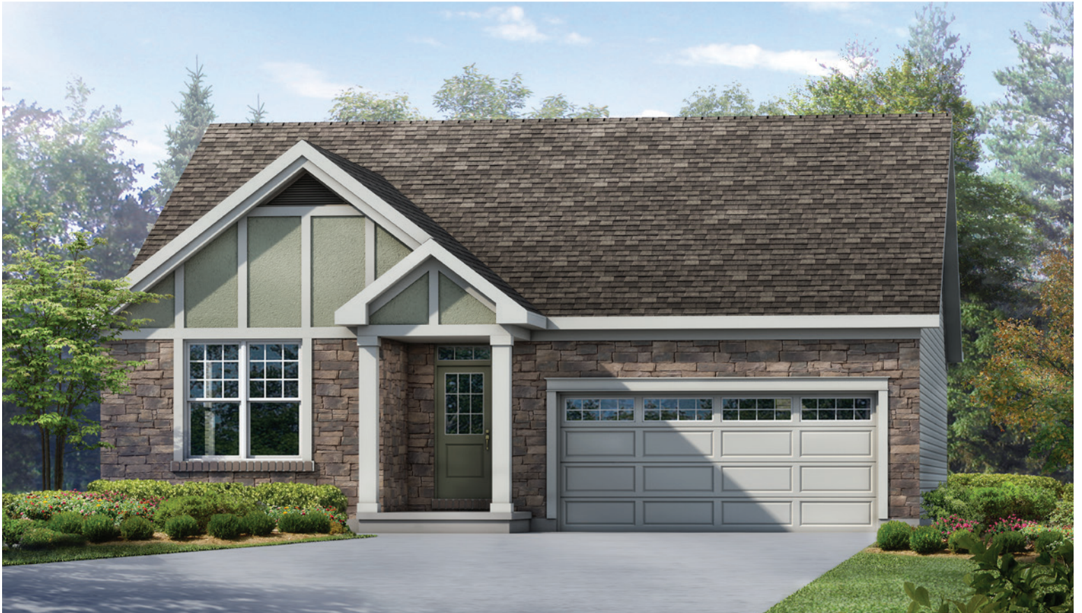
OPTIONAL/UPGRADED EXTERIOR Artist renderings shown. Interpretations are subject to change*